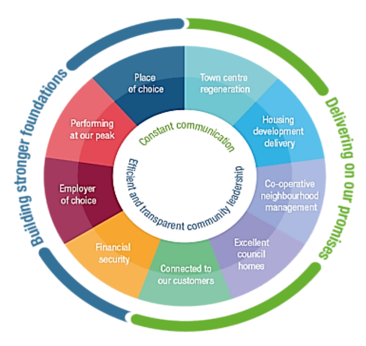
Figure 1: Future Town, Future Council Programme